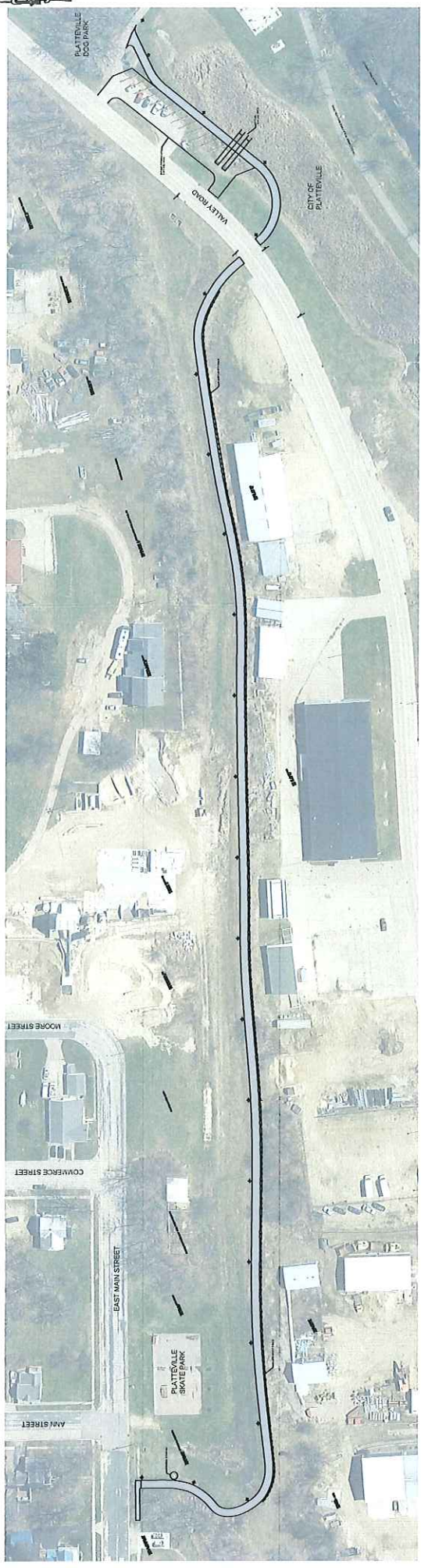
EAST MAIN STREET TO DOG PARK CONNECTING TRAIL PRELIMINARY LAYOUT