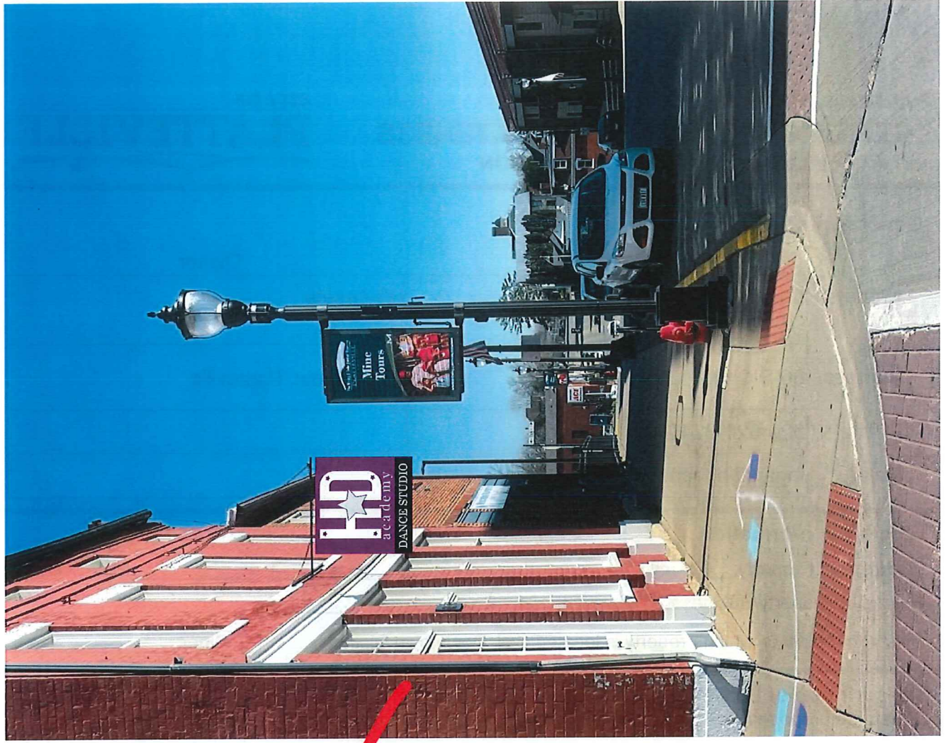
4'x4' Double sided 1/4" Alupanel sign $ 660.00 Install on existing bracket (no bracket repair) $180.00