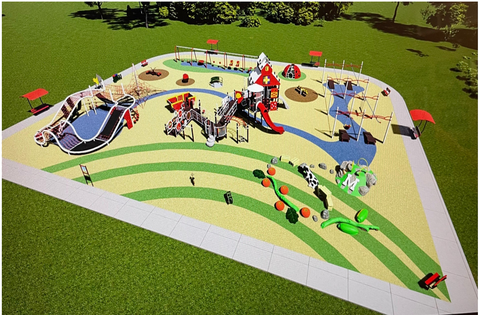
Platteville Inclusive Park – Park Planet Preliminary Design View 1