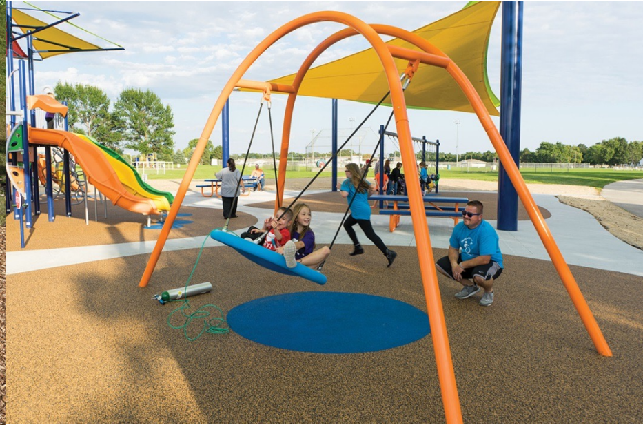
Inclusive Park Equipment Examples