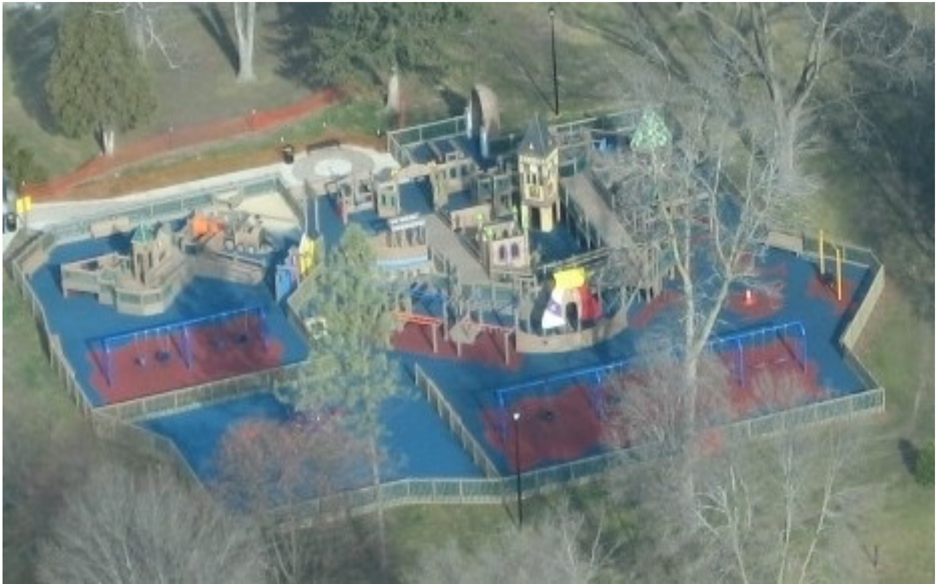
Wisconsin Inclusive Park Example 4--Oconomowoc, WI