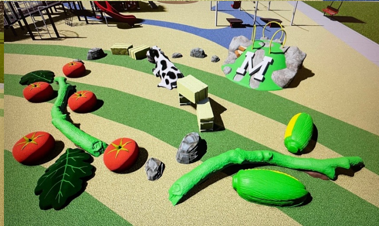
Inclusive Park Equipment Examples