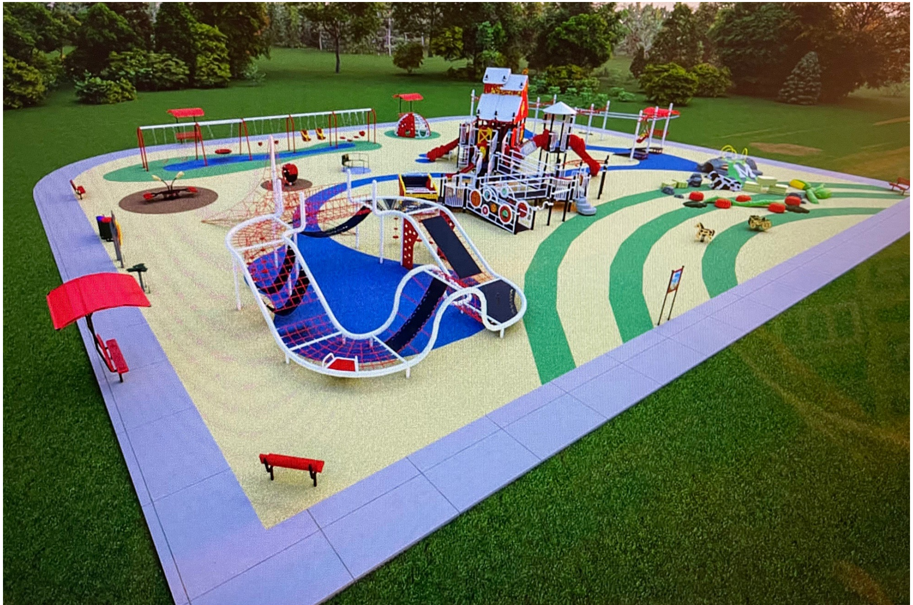
Platteville Inclusive Park – Park Planet Preliminary Design View 2