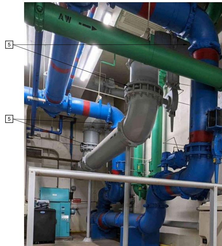
6 PAINTING REHAB - WASTE BACKWASH WEST WALL 700-RM9.1 NOT TO SCALE