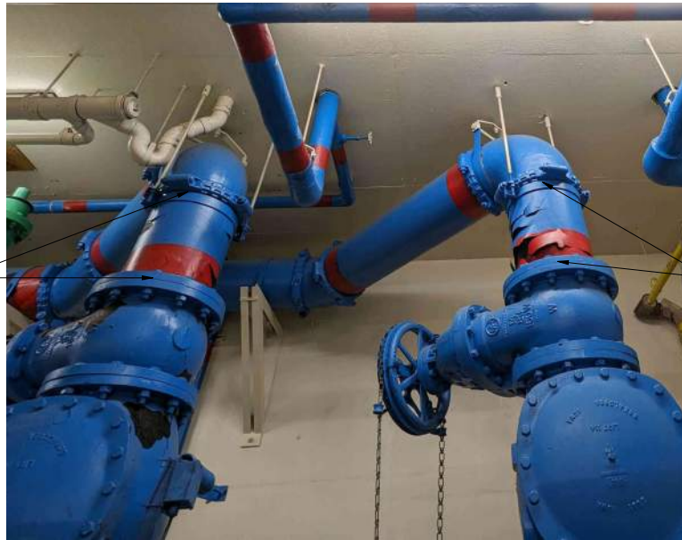
1 PAINTING REHAB - BACKWASH PUMPS 700-RM9.1 NOT TO SCALE