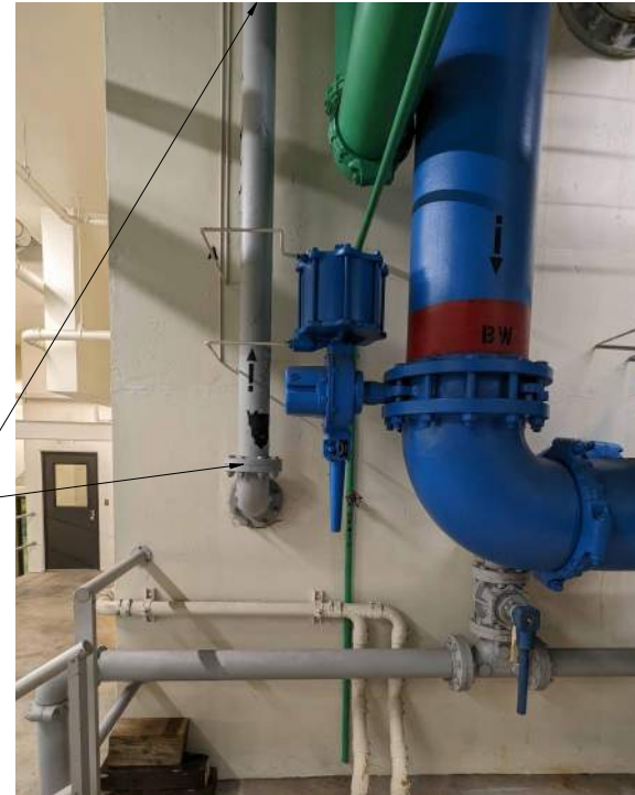
2 PAINTING REHAB - VENT IN PIPE GALLERY 700-RM9.1 NOT TO SCALE