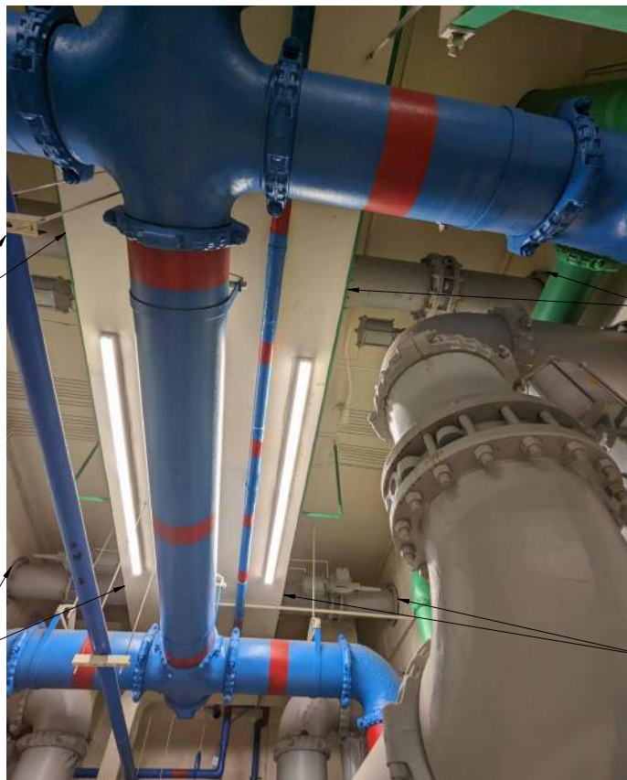
4 PAINTING REHAB - FILTER INFLUENT 700-RM9.1 NOT TO SCALE