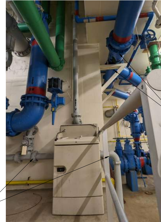
3 PAINTING REHAB - DRAIN IN PIPE GALLERY 700-RM9.1 NOT TO SCALE